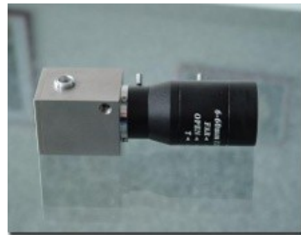
CS camera with variolens