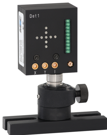
Figure 1: Rear view of WID detector (The base plate is not included in the delivery.)