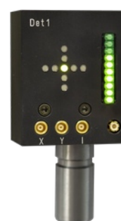
Figure 2: Detector with LEDs for position and intensity and connectors

The special characteristic of this 4-quadrant detector is that it covers a very large dynamic range of laser power/intensity over a factor >1000. This means that the laser intensity can be varied or modulated over three decades without changing the gain or replacing filters. For this purpose, the WID detector uses a special logarithmic amplifier that provides a constant signal-to-noise ratio over the entire intensity range. Thus, it can be used wherever laser powers are strongly varied. These are, for example, applications in laser machines with high-power lasers that are prealigned with low power, or applications in spectroscopy with varying wavelengths and powers.