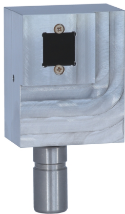
Figure 2: Clean room detector

Our detectors are available as clean room and vacuum versions. In both versions, we attach great importance on the choice of materials to prevent the introduction of contaminants through outgassing. Both versions do not have LED indicators on the backside. The corresponding signals for beam position and intensity control can be read out by analog outputs on the controller, via the serial interface or in the software. The controller itself must not be placed in vacuum.